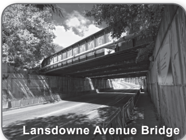
Lansdowne Avenue Bridge