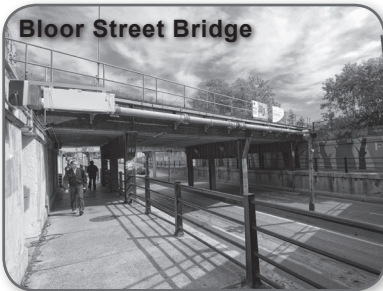
Bloor Street Bridge