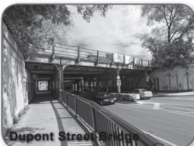
Dupont Street Bridge