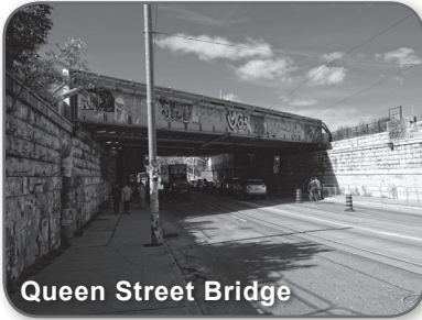
Queen Street Bridge