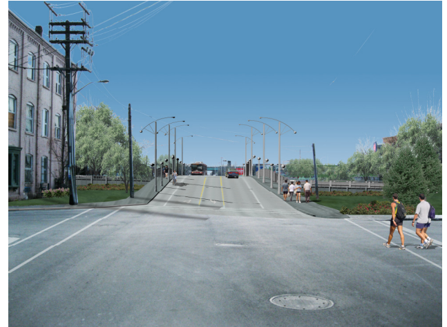
Looking south toward proposed Strachan Overpass