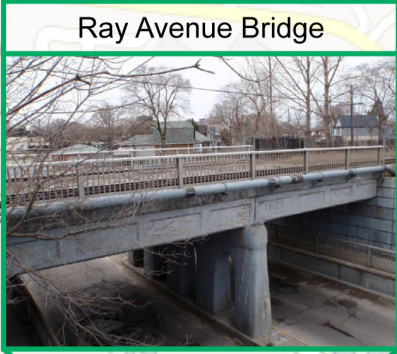
Ray Avenue Bridge