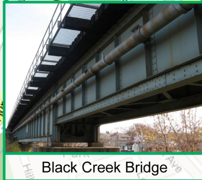
Black Creek Bridge