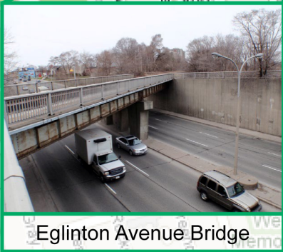
Eglinton Avenue Bridge